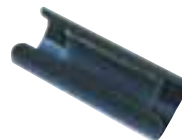
Black brush for use on copper. Cat number: SB4